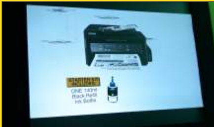
Visual Interlude of EPSON India Pvt. Ltd.