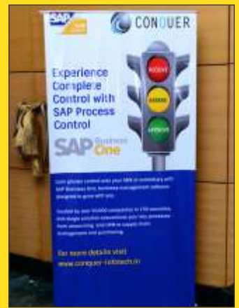
Partners Promotion Standby at "Small is Big" - Venue