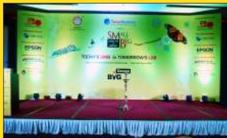
"SMall is Big" - Main Stage