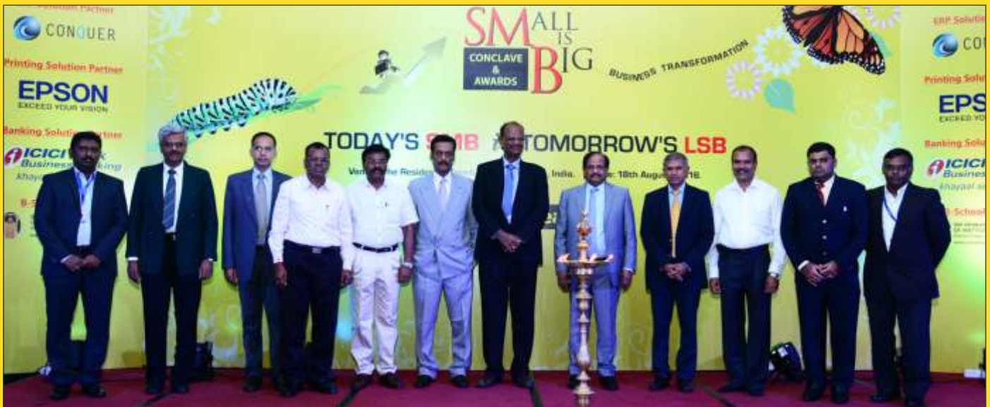
Hon. Dignitaries and Organisers of "Small is Big" on the Diars after Lighting of the Traditional Lamp.