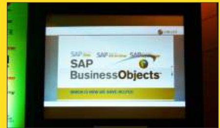
Visual Interlude of CONQUER INFOTECH INDIA PVT. LTD.