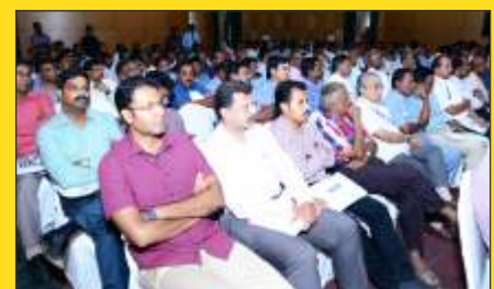
Delegates at "Small is Big"