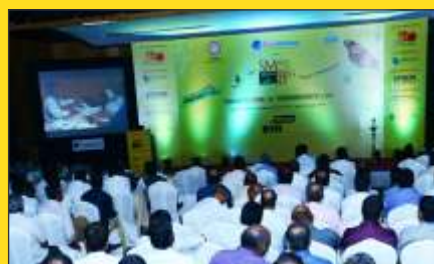
Visual Interlude of ICICI Bank Ltd.,