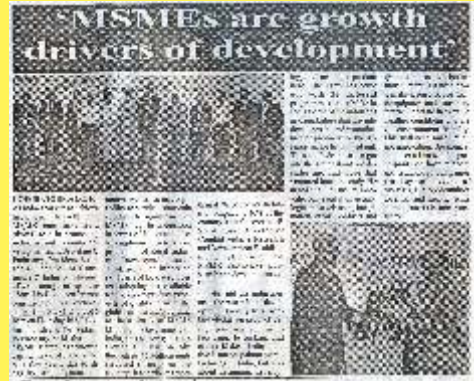
Event Coverage in After Noon News Paper Dated : 19th August 2016