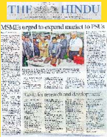
Event Coverage in The Hindu News Paper Dated : 19th August 2016