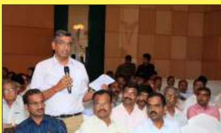
Delegates Interacting with Panelists