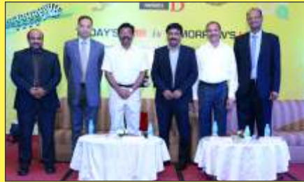
Panel Discussion - "Small to Big - Proven Growth Methodologies from Successful Entrepreneurs"