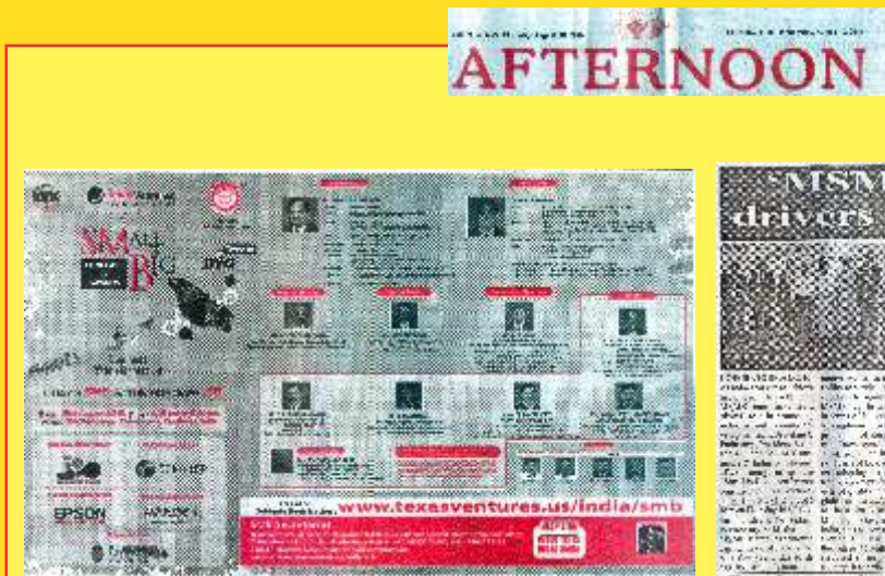
Half Page Advertisement in After Noon News Paper Dated : 17th August 2016