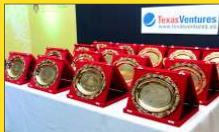
Memento for Speakers, Panelists and Partners.