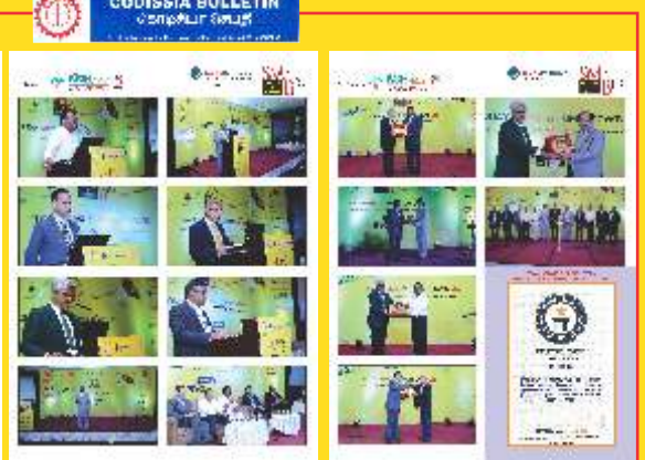
EDM Electronic Direct Mailer