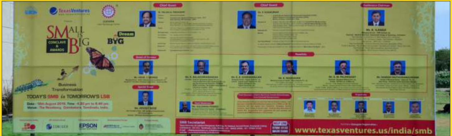
"SMall is Big" Hoarding at Codissia Trade Fair Complex.